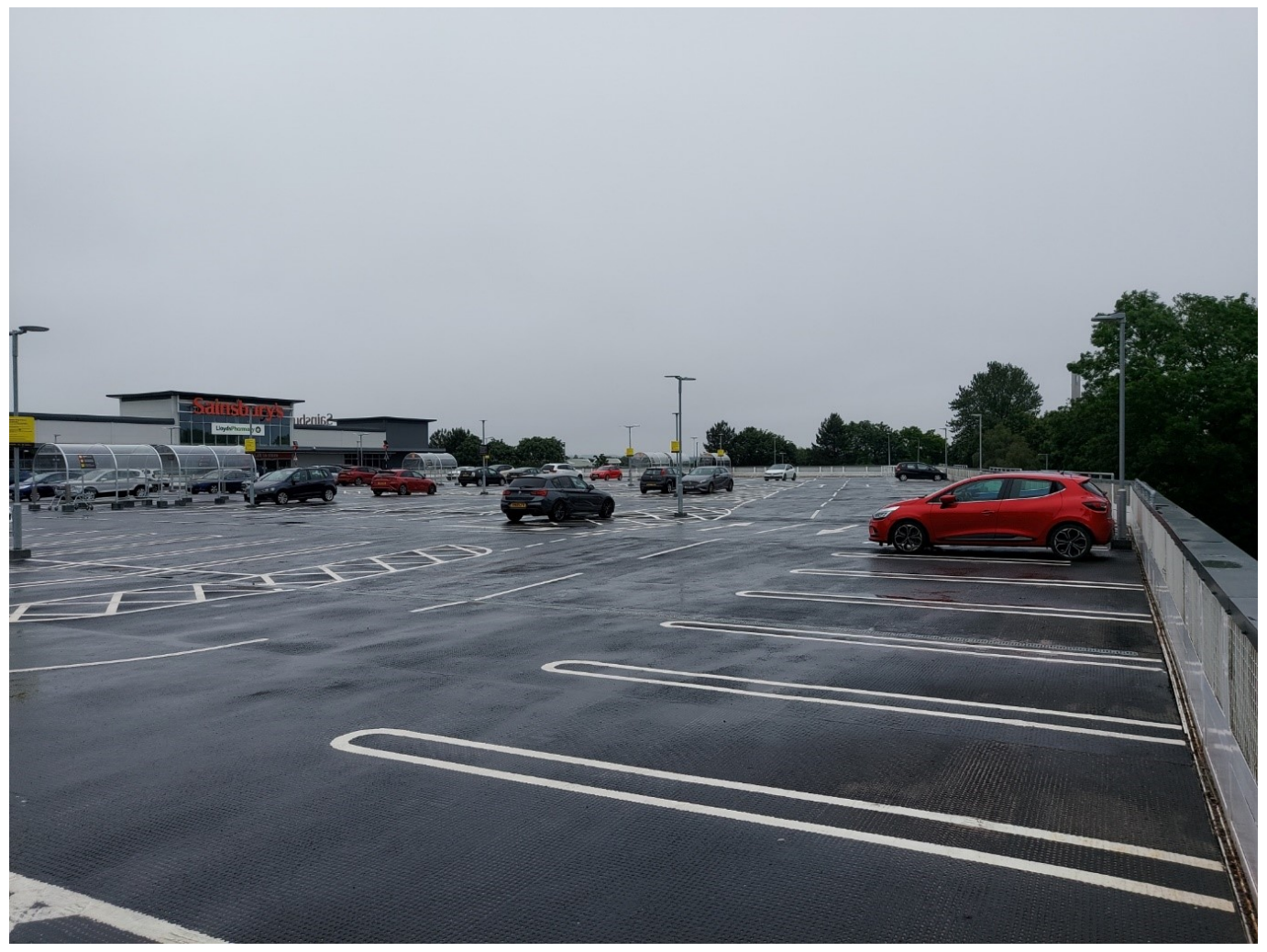
RG Group Sainsburys – Weedon Rd, Northampton, Northamptonshire