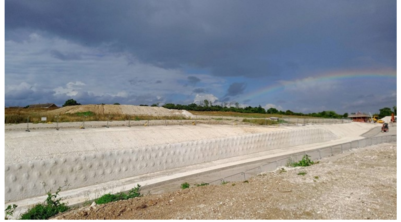
Bellway Essex - Saffron Walden, Essex