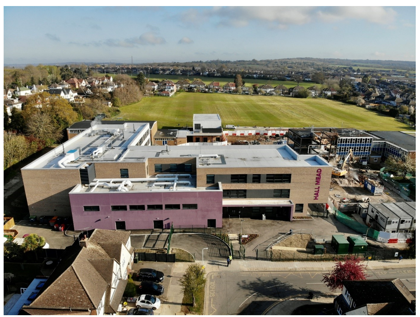
Bowmer & Kirkland - Hall Mead School - Upminster, East London