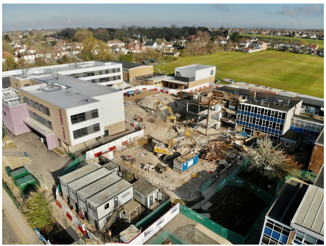
Bowmer & Kirkland - Hall Mead School - Upminster, East London