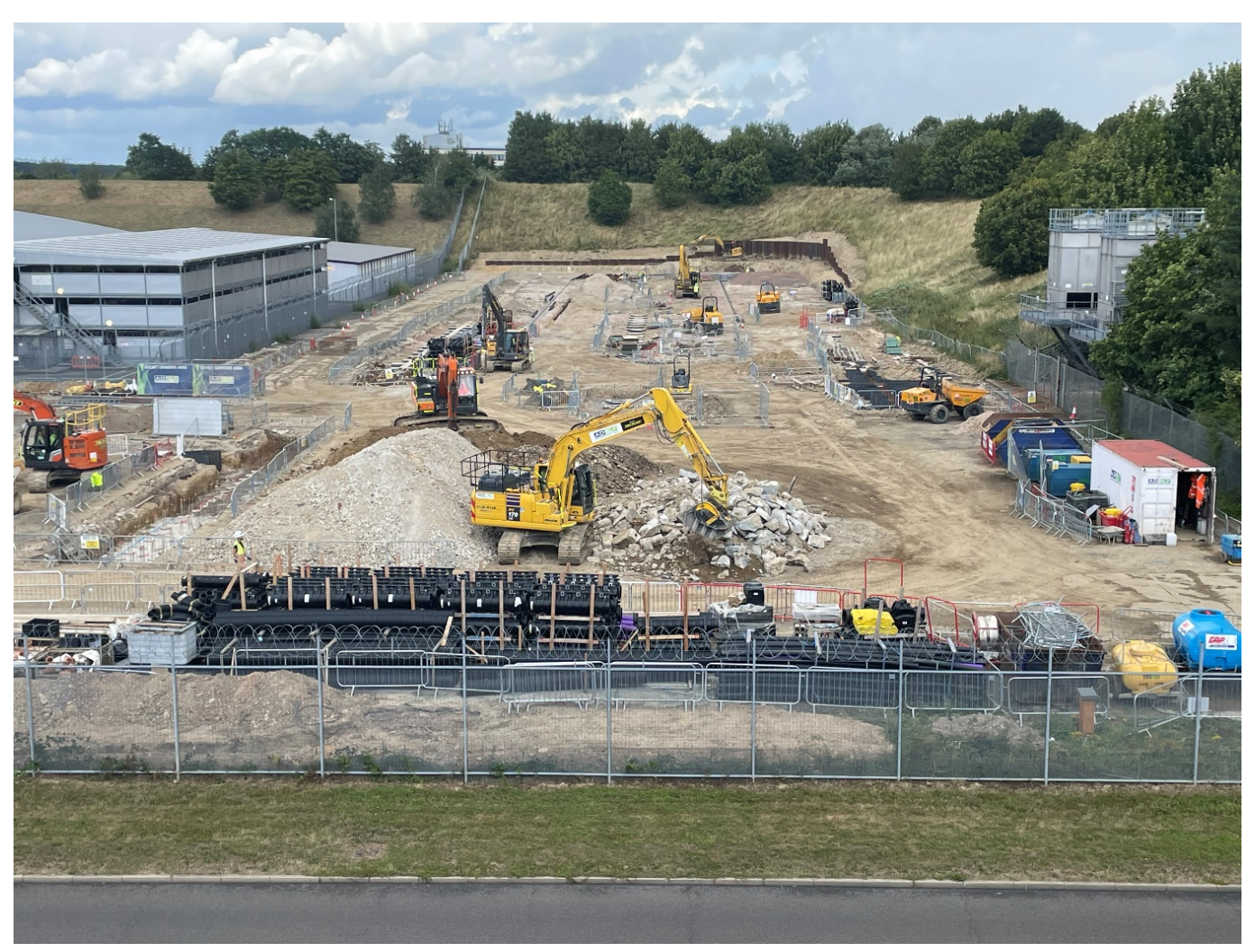
Goldbeck Ltd - Gatwick Airport